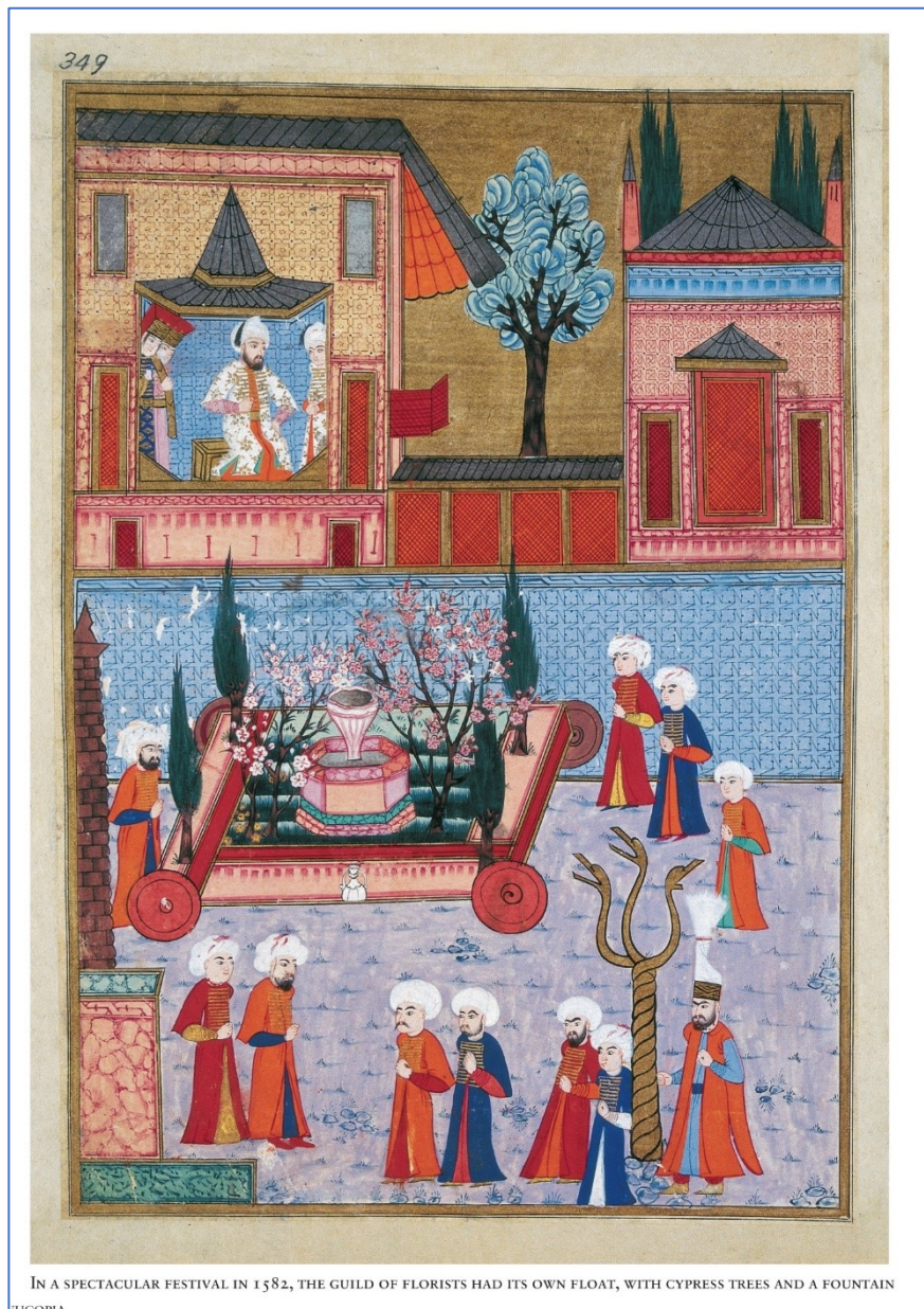
IN A SPECTACULAR FESTIVAL IN 1582, THE GUILD OF FLORISTS HAD ITS OWN FLOAT, WITH CYPRESS TREES AND A FOUNTAIN